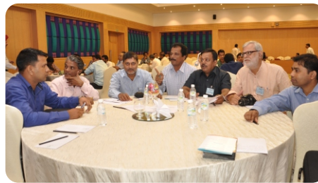
Participants of the conference