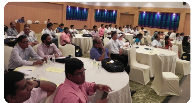
Participants during National Partners' meet