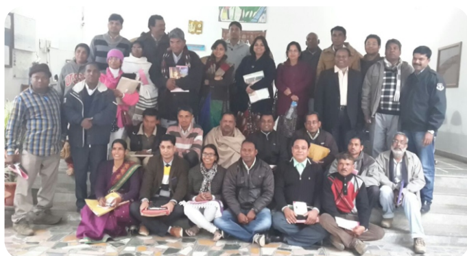
Participants of PIP Meet, Lucknow

As a continuation of the PSC meeting and the approval of new project, we have conducted two Project Implementation Plan orientation and New Partners Meet for the 26 new partners. The first meeting was