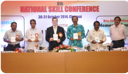
Release of FVTRS DVD's