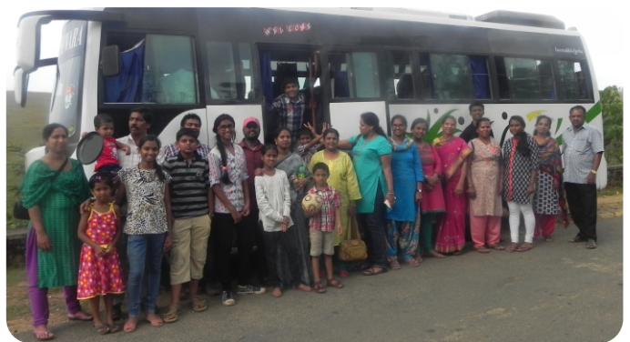
FVTRS Team with their family during exposure tour

The staff members of FVTRS along with their family had a visit to Kerala. They visited Kottayam Social Service Society, their agricultural farm and the programmes promoted by FVTRS. This occasion was used to take the family members to Vagamon, St. Alphonsa Pilgrim Centre, Bharananganam. They also went for a house boat trip in the backwaters of Kerala at Kumarakom and visited Alleppey beach.