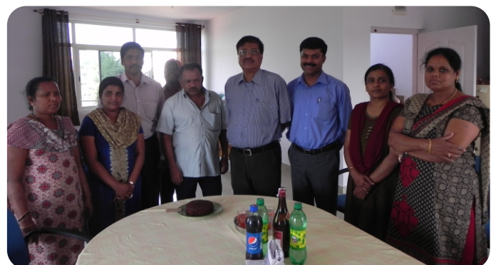
FVTRS Team during Christmas celebration