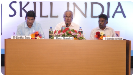
Thematic session Resource persons