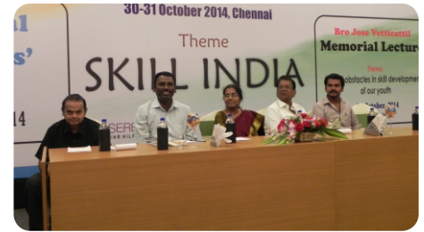
Dignitaries on the stage